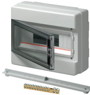
IMMAGINE RAPPRESENTATIVA EC REPRESENTATIVE IMAGE

Enclosures > Wall-mount > Wall modular enclosures > Series 620 - ip65 modular enclosures > Small distribution board > Grey - equipped